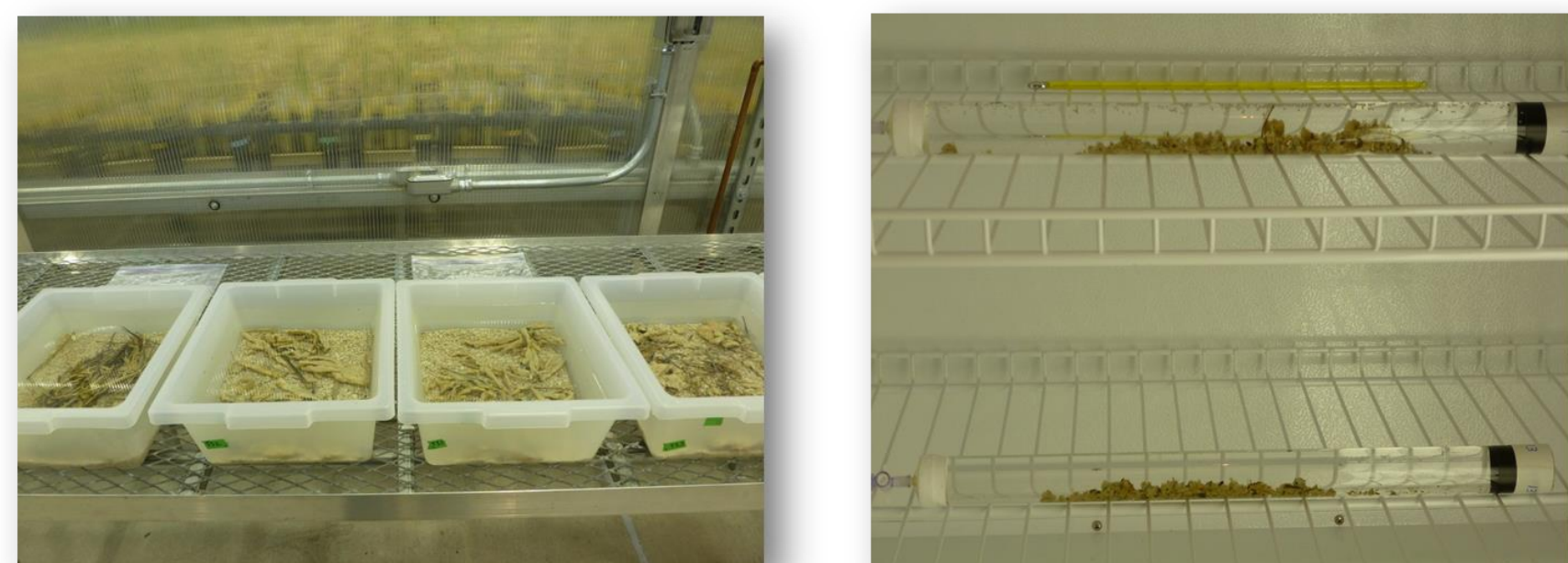
Figure 1: (Left) Periphyton microcosms in research greenhouse (Right) Quartz tubes with periphyton samples in an incubator.